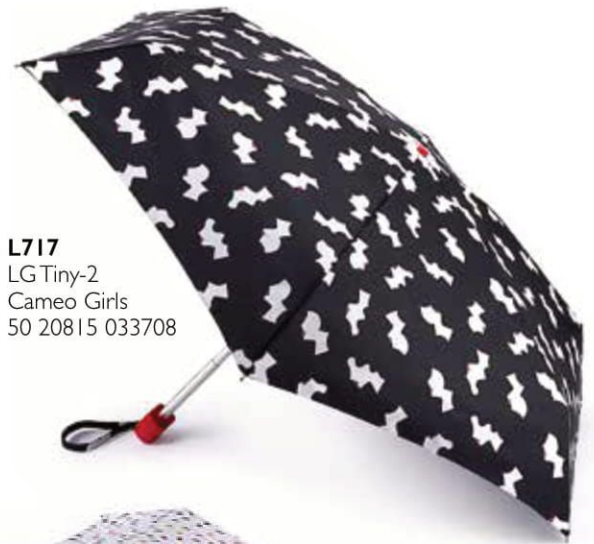
L717 LG Tiny-2 Cameo Girls 50 20815 033708