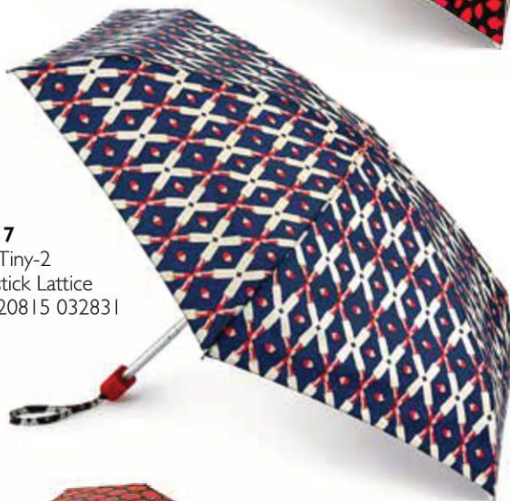
L717 LG Tiny-2 Lipstick Lattice 50 20815 032831