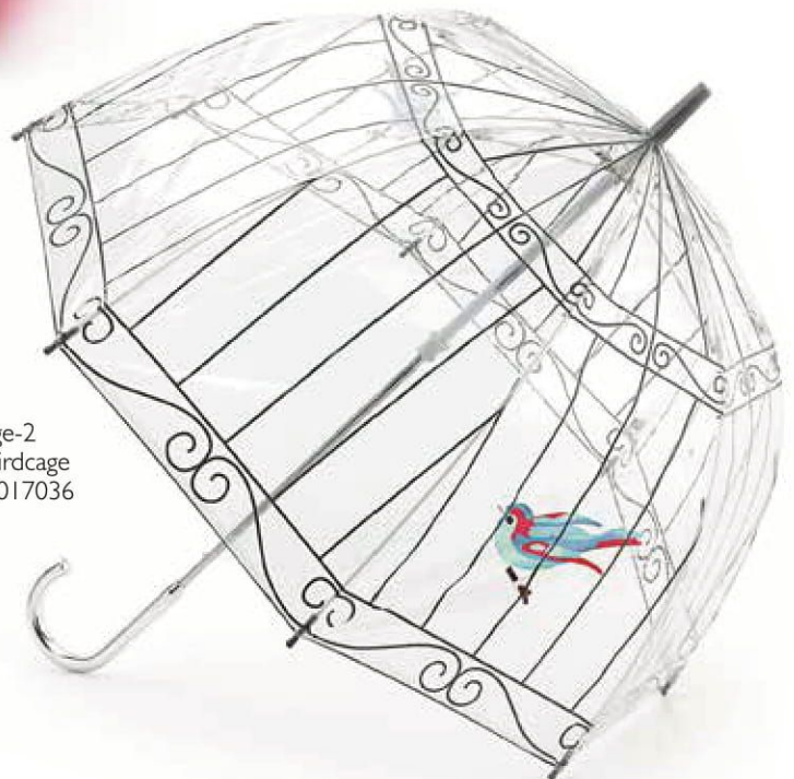
L719 LG Birdcage-2 Birdcage Birdcage 50 20815 017036