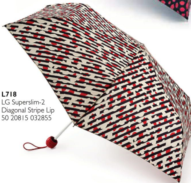
L718 LG Superslim-2 Diagonal Stripe Lip 50 20815 032855