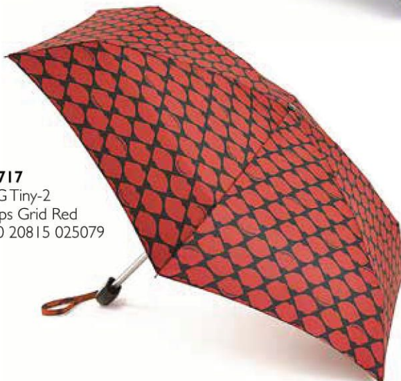
L717 LG Tiny-2 Lips Grid Red 50 20815 025079