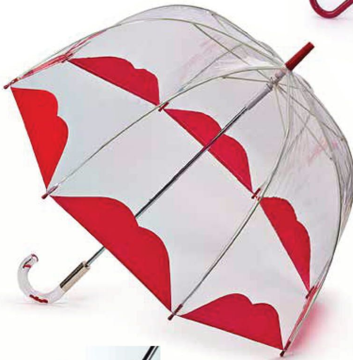
L719 LG Birdcage-2 Half Lip 50 20815 032886