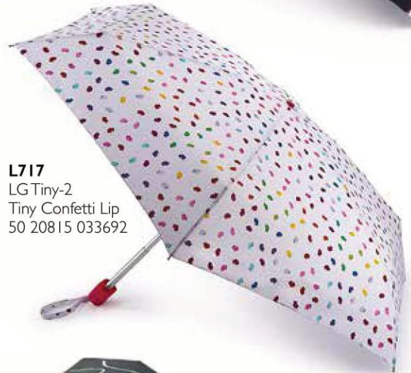
L717 LG Tiny-2 Tiny Confetti Lip 50 20815 033692