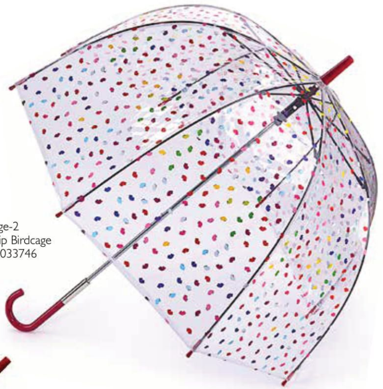
L719 LG Birdcage-2 Confetti Lip Birdcage 50 20815 033746