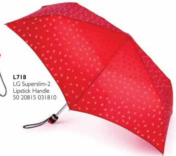
L718 LG Superslim-2 Lipstick Handle 50 20815 031810