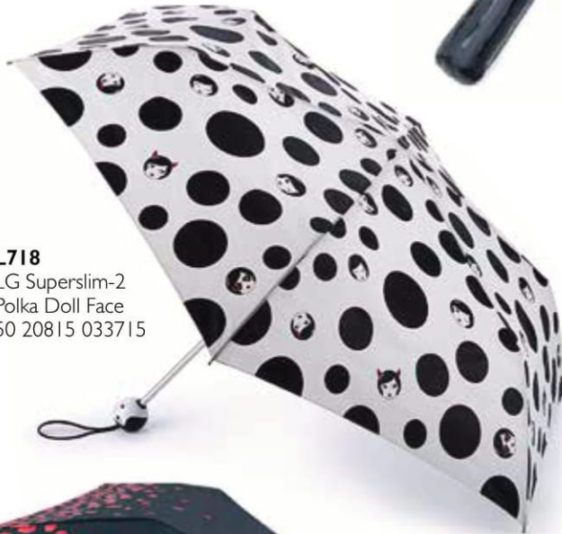
L718 LG Superslim-2 Polka Doll Face 50 20815 033715