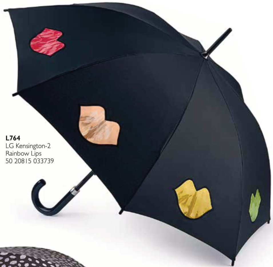
L764 LG Kensington-2 Rainbow Lips 50 20815 033739