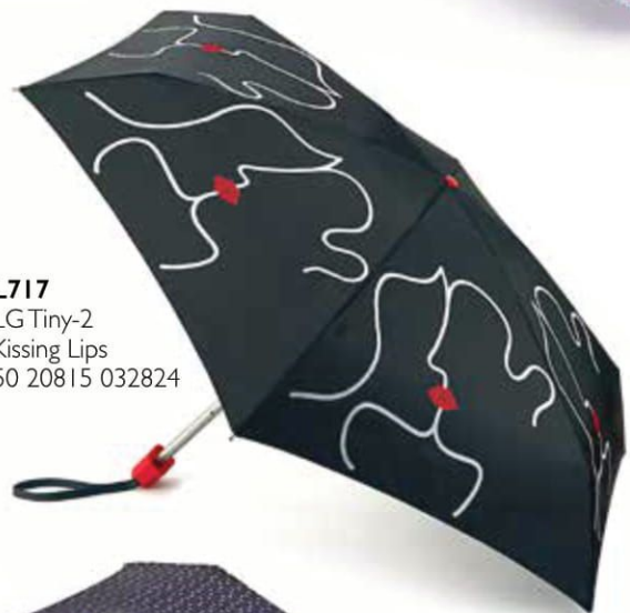
L717 LG Tiny-2 Kissing Lips 50 20815 032824