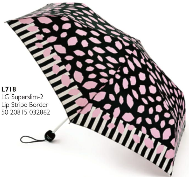
L718 LG Superslim-2 Lip Stripe Border 50 20815 032862