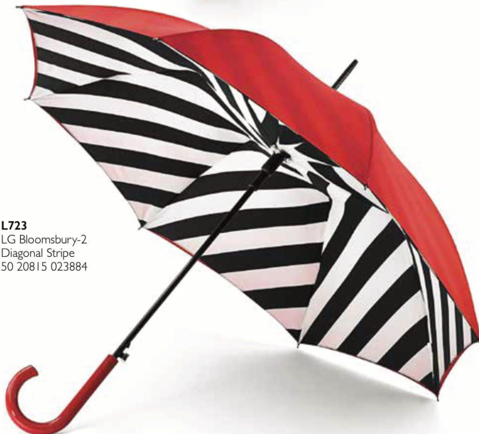
L723 LG Bloomsbury-2 Diagonal Stripe 50 20815 023884