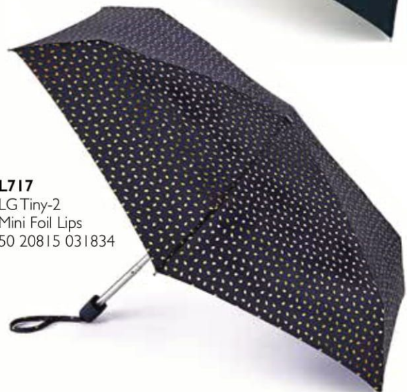
L717 LG Tiny-2 Mini Foil Lips 50 20815 031834