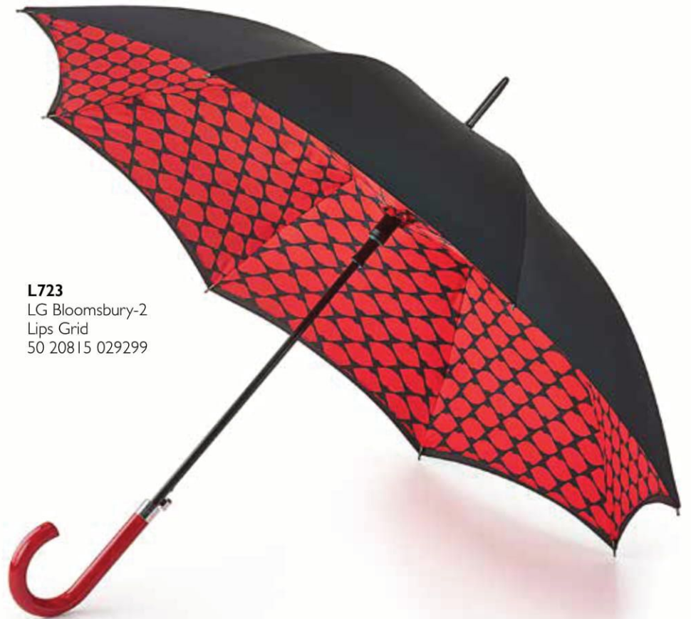
L723 LG Bloomsbury-2 Lips Grid 50 20815 029299