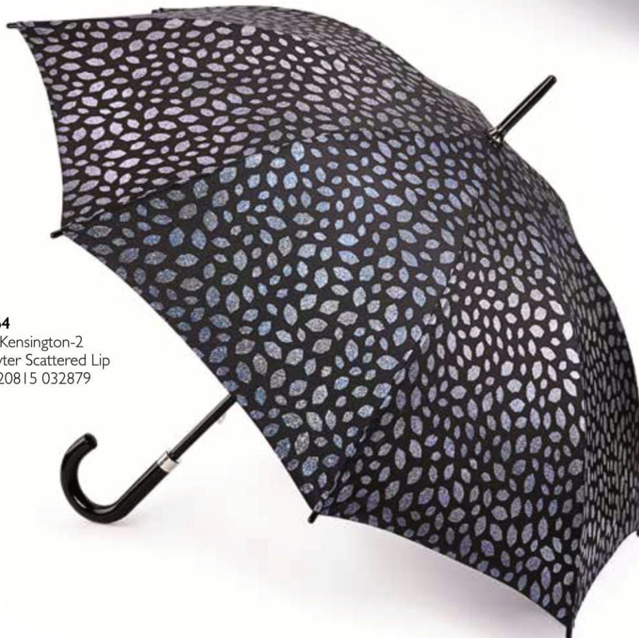
L764 LG Kensington-2 Pewter Scattered Lip 50 20815 032879