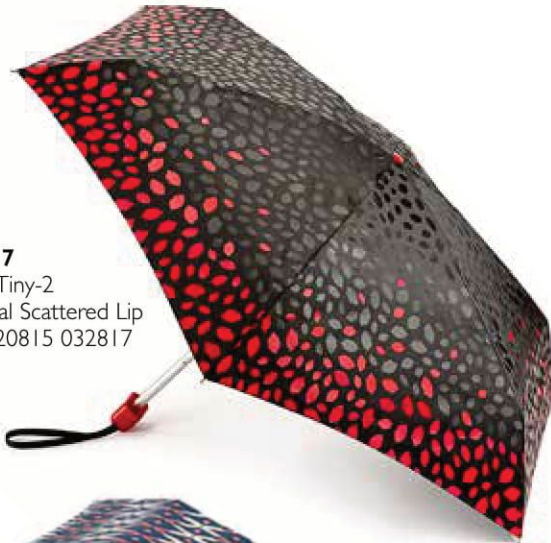
L717 LG Tiny-2 Tonal Scattered Lip 50 20815 032817