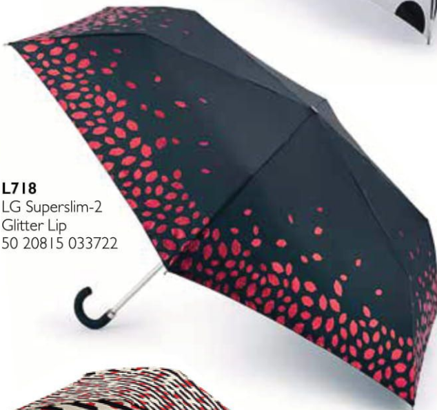
L718 LG Superslim-2 Glitter Lip 50 20815 033722